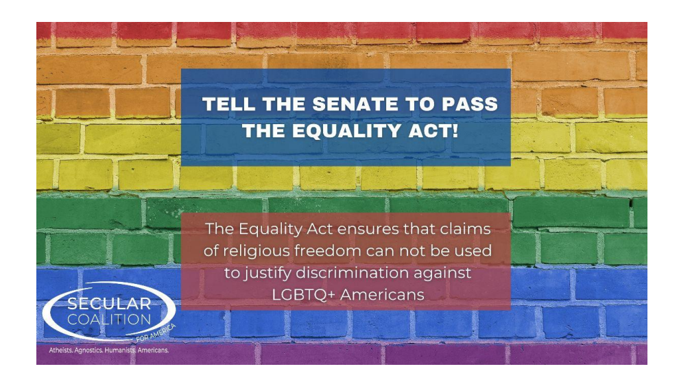
Tell the Senate to Support the Equality Act - Secular Coalition for America

nothing to change that. Additionally, 21 states have had similar nondiscrimination laws on the books for decades now and they have worked, as there have been no increases in public safety incidents in bathrooms since they were codified.